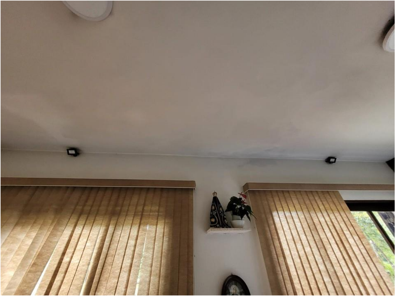
Infiltrations in the Chapel ceiling