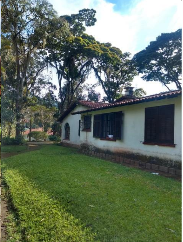
Roof and outside