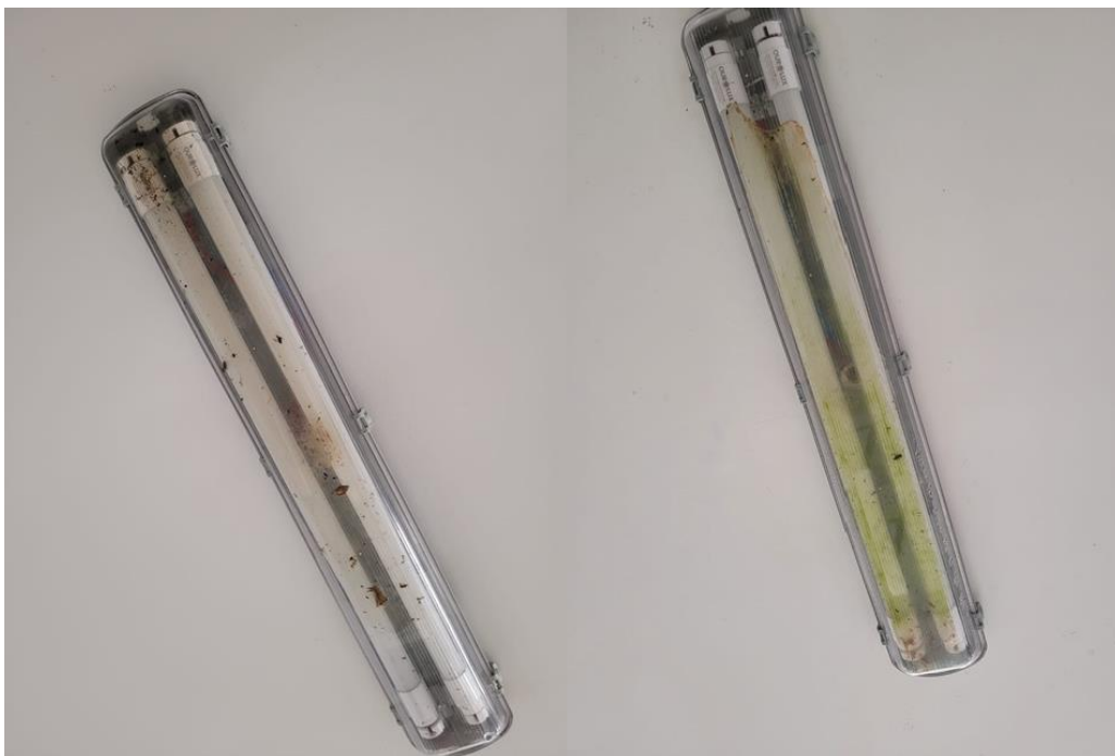
Leaks in the ceiling of our central kitchen.