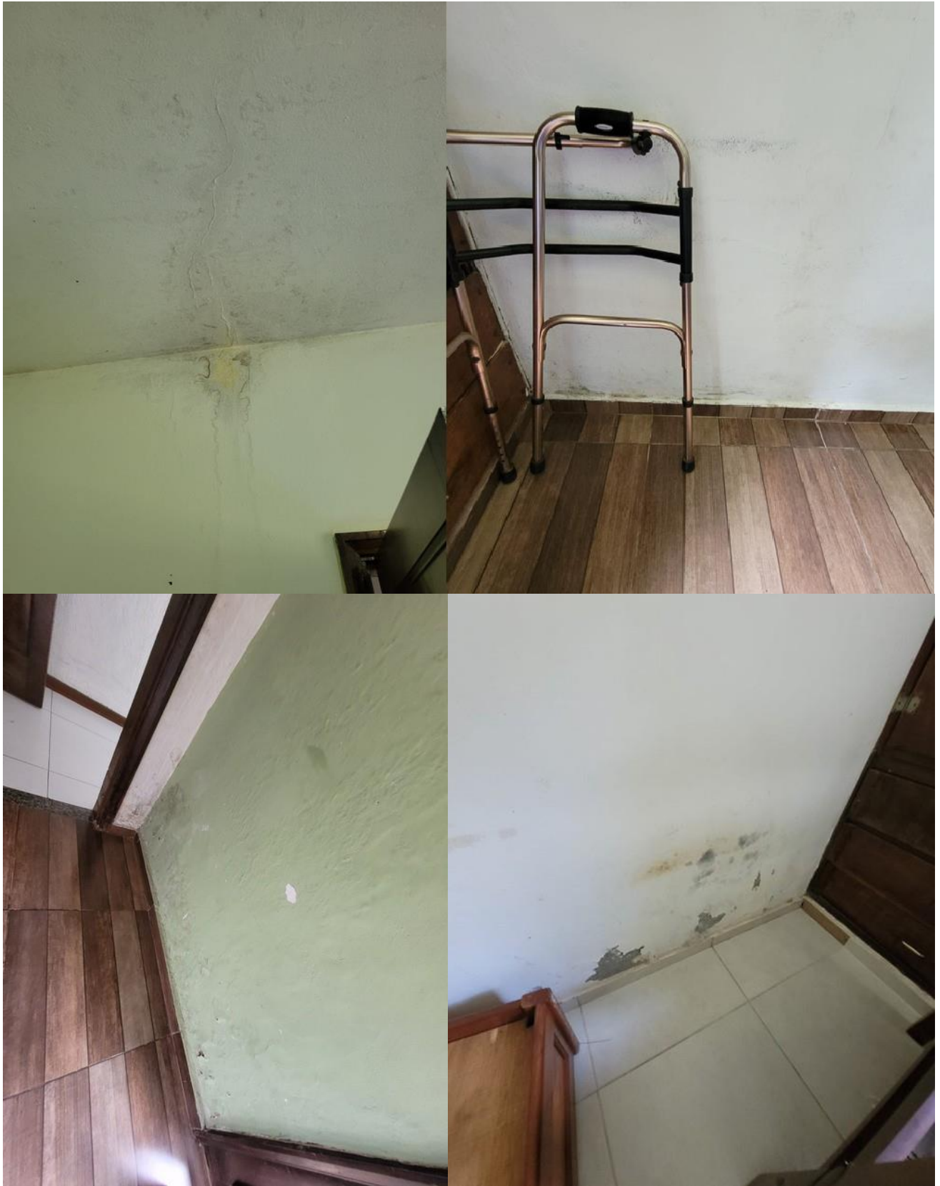
Infiltration in the walls and ceiling of the rooms.