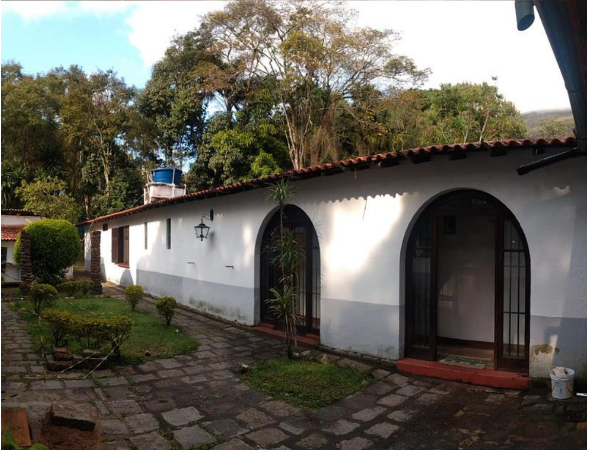
Several Infiltrations in the lower part of the walls