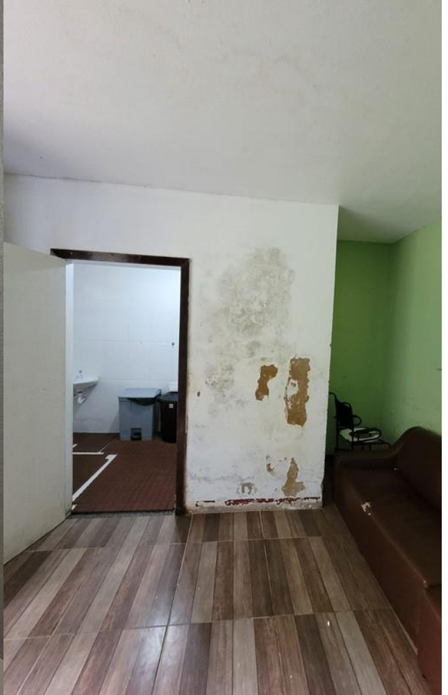
Infiltration in the walls and ceiling of the rooms.